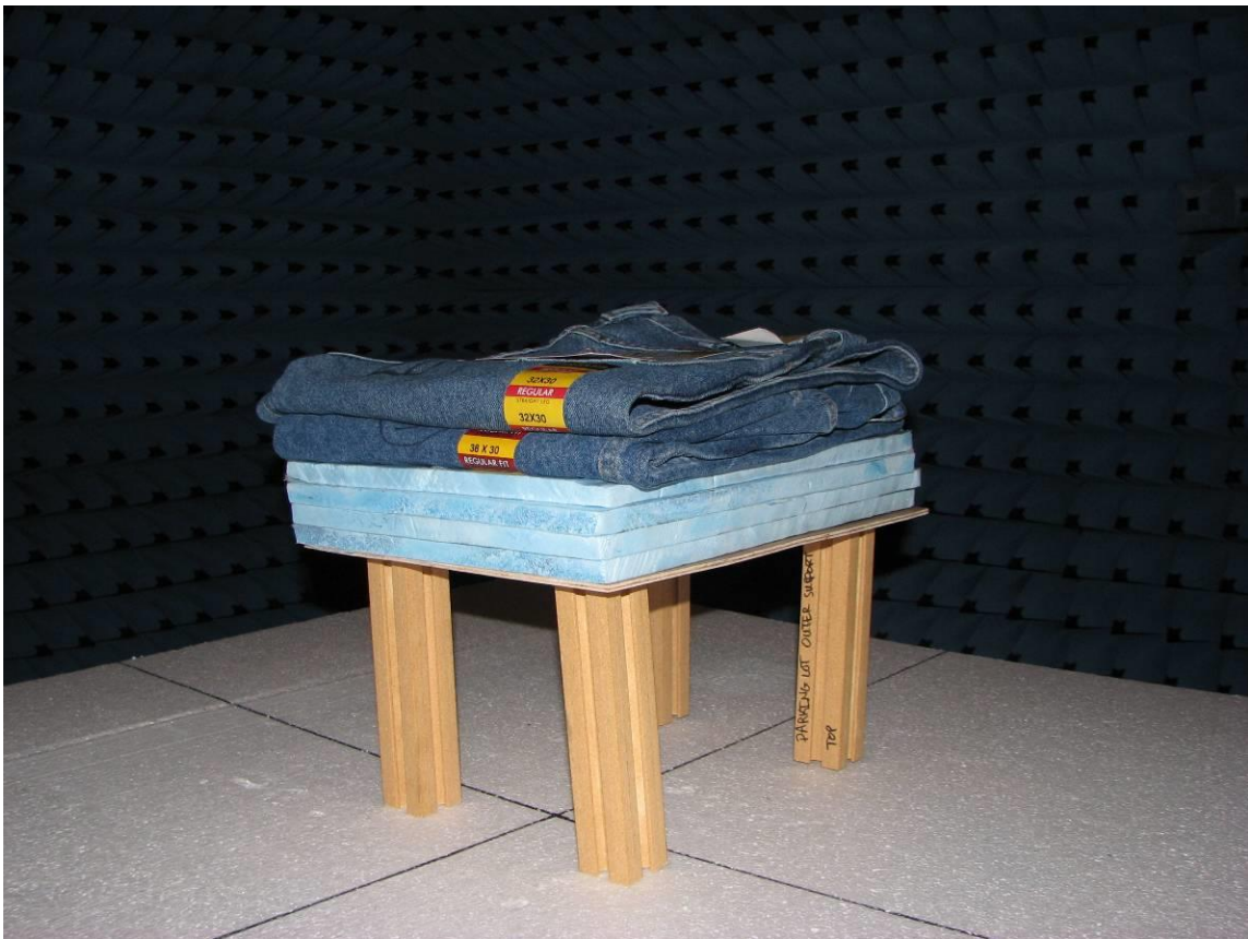
Figure 2: Single Inlay between Two Denim Articles

The inlay is measured when applied on the pocket flasher of a denim article with another untagged denim article placed on top of the tagged denim. Both the articles are placed on the testing platform as shown in Figure 2. The tagged denim article is placed on the platform such that the inlay is on the top. The face of the inlay will be parallel to the face of antenna 4.