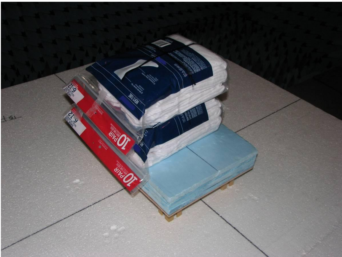
Figure 2: Single Inlay between Two Polybags

The inlay is measured when applied on a polybag containing ten cotton articles with another untagged bag placed on top of the tagged bag. Both the bags are placed on the testing platform as shown in Figure 2. The tagged bag is placed on the platform so that the inlay is on the top. The face of the inlay is parallel to the face of antenna 4.