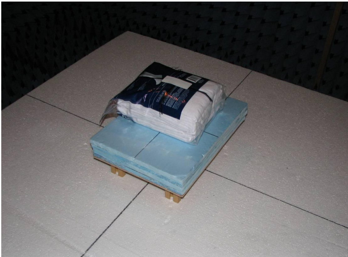
Figure 1: Single Inlay on Polybag

The inlay is measured when applied on a polybag containing ten cotton articles. The bag is placed on the testing platform with the tagged side on the top as shown in Figure 1. The face of the tag is parallel to the face of antenna 4.