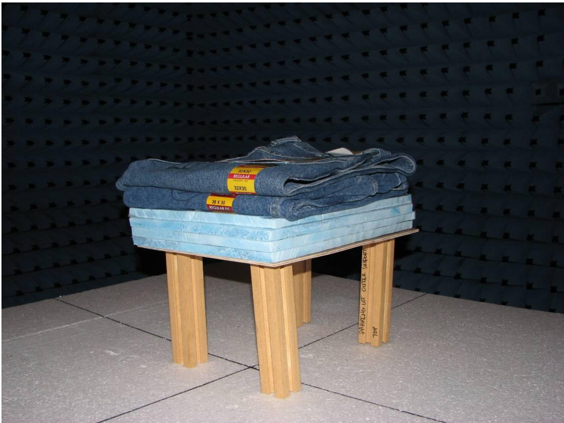
Figure 3: Single Inlay between Two Denim Articles

The inlay is measured when applied on the pocket flasher of a denim article with another untagged denim article placed on top of the tagged denim. Both the articles are placed on the testing platform as shown in Figure 2. The tagged denim article is placed on the platform such that the inlay is on the top. The face of the inlay will be parallel to the face of antenna 4.