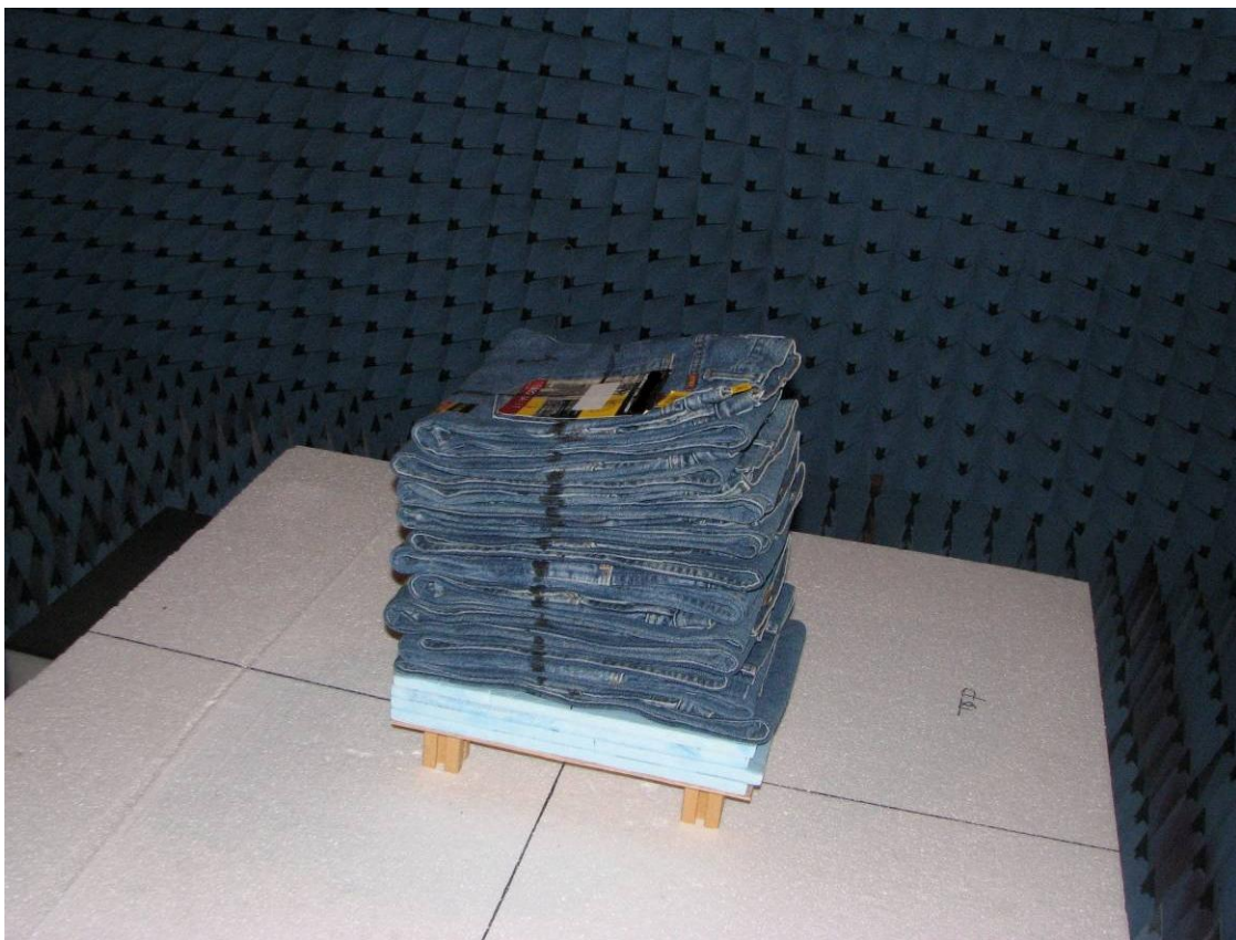
Figure 5: Multi Inlay Proximity Test with Denim

The inlay is measured when applied on the pocket flasher of a denim article (inlay on top) in the center of a stack of 10 other tagged denim articles. All the denim articles are tagged with inlays of the same model. The final stack is 11 denim articles tall. All of the articles are placed on the testing platform as shown in Figure 4. The faces of the tags will be parallel to the face of antenna 4.