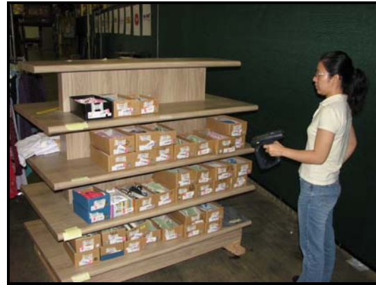
Photograph 7: Static Fixture—Mobile Reader Testing With Shoes

For the shoe test, items were tagged and placed on the shelf fixture. An associate would use a mobile device to scan the items on the shelf by walking around the fixture while pointing the device at the items. The mobile readers were used in a sweeping motion around the fixture making sure that the reader was used in both horizontal and vertical orientations to account for tag orientation. This process allowed the associate to capture the available reads. See Photograph 7.