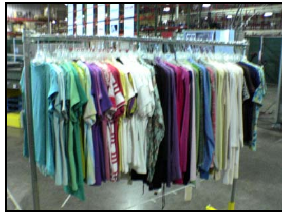
Photograph 3: Clothes Placement on Z-Bar