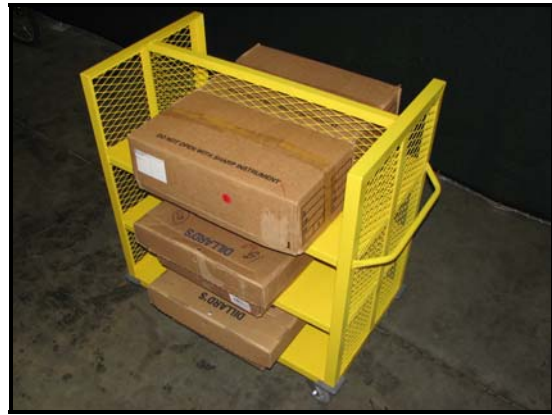
Photograph 18: Boxes on Steel Cart