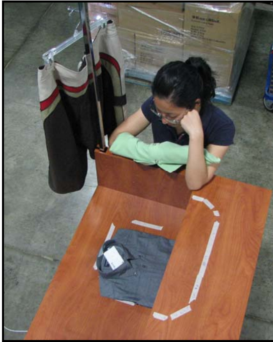
Photograph 12: Point of Sale

While the reader was actively scanning for tags, tagged items were hung on the extendable bar built in as an extension of the desk and designed for exactly this purpose. This scenario might