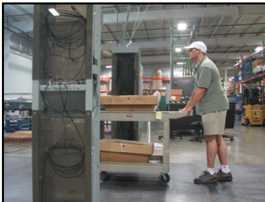
Photograph 15: Testing With Boxes on Handcart

For the box test, the portal was configured in compliance with EPCglobal Dynamic Door Portal Test Specification and EPCglobal Dynamic Conveyor Portal Test Specification standards. The first box test consisted of two boxes on one handcart per level which was moved through the portal (see Photograph 15). The second box test consisted of a single box of items hand carried through the portal by an associate (see Photograph 16). The third box test consisted of boxes being transported at three different speeds (600, 400, and 200 feet per minute) on the conveyor (see Photograph 17). The fourth box test consisted of boxes on a steel cart (see Photograph 18).