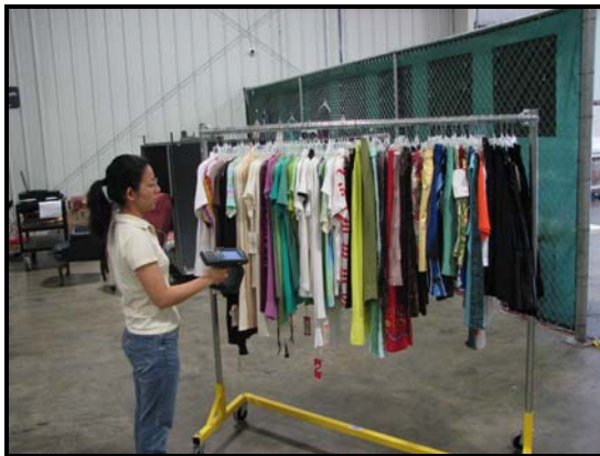
Photograph 2: Static Fixture—Mobile Reader Testing With Z-Bar