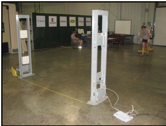
Photograph 13: Portal for Testing with Z-Bar

For the z-bar test, the portal was configured in compliance with EPCglobal Dynamic Door Portal Test Specification standards (set at 10 feet apart). See Photographs 13 and 14. For testing, an associate would push the z-bar through the portal 30 times at a constant speed.