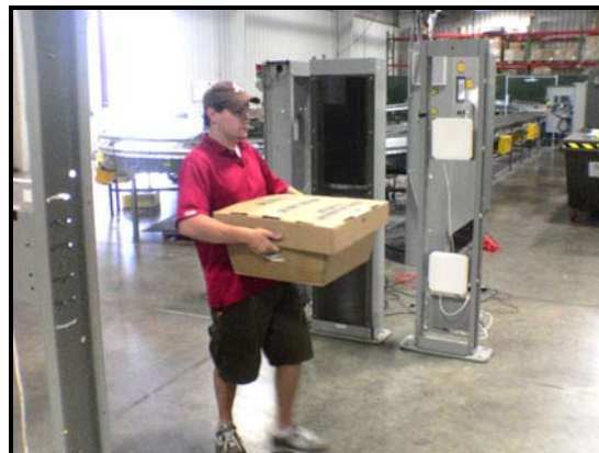
Photograph 16: Testing With Hand Carried Box