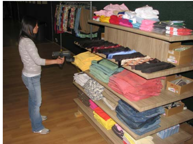
Photograph 6: Static Fixture—Mobile Reader Testing With Shelf

For the shelf test, items were tagged and placed on the shelf fixture. An associate would use a mobile device to scan the items on the shelf by walking around the fixture while pointing the device at the items. The mobile readers were used in a sweeping motion around the fixture making sure that the reader was used in both horizontal and vertical orientations to account for tag orientation. This process allowed the associate to capture the available reads. See Photograph 6.