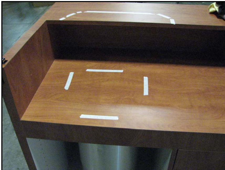
Photograph 10: Demarcated Read Area on Sales Desk Surface

The reader's power setting was reduced from maximum power, 30 dBm, to the lowest setting capable of being entered through the user interface, 15 dBm. This reduced the read field to the area shown in Photograph 10. The masking tape describes the boundary of the read field. The height of the field from the top of the counter is approximately 1.5 feet in free space. The read field still expands slightly outward as it moves away from the top of the cylinder, but the circumference to which it expands is greatly reduced, which is desired.