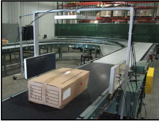
Photograph 17: Box on Conveyor Passing Through Portal