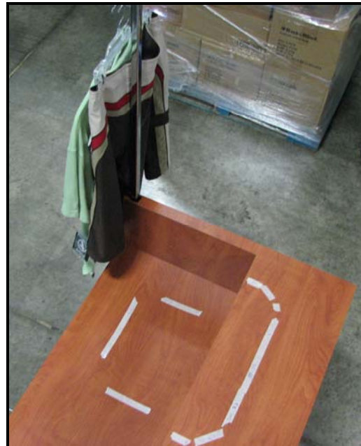
Photograph 11: Point of Sale

The overall test results from the point of sale scenarios listed above were very positive. In addition to the data reported herein, additional qualitative experiments consisted of various “real-world” enactments designed to stress test the physical capabilities of this POS system in methods typical to those seen during average checkout activities. The premise behind this testing is that a POS system by nature needs to read 100% of only the group of sales items intended for checkout.