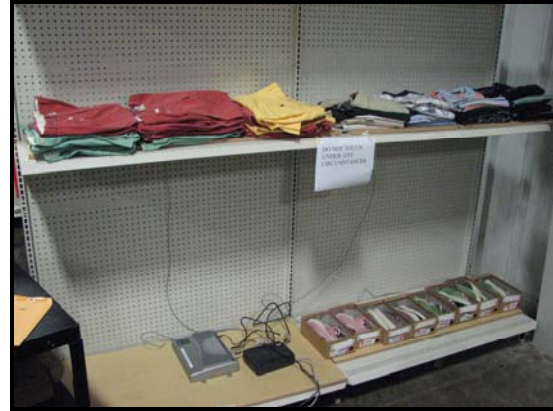
Photograph 8: Smart Shelf

The test scenario is defined as static items/static reader. The purpose of this test is to determine how well (%) items can be read on a static fixture while utilizing a static RFID reader. In this scenario, tagged items are placed on a fixture (e.g., shelf or table), and then read by the static reader attached to the fixture.