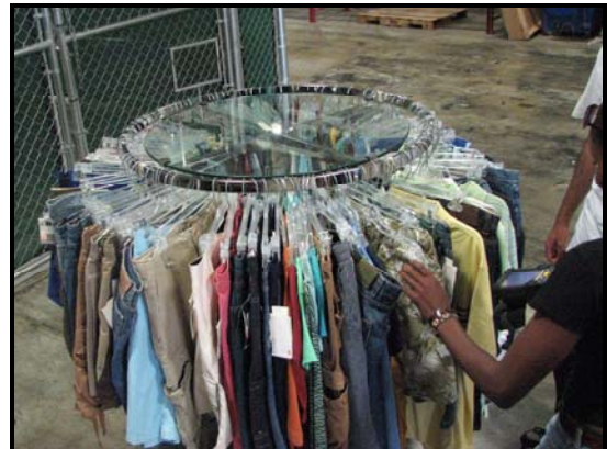
Photograph 1: Scanning a Rounder Using a Handheld Reader

For the rounder test, items were tagged and placed on the rounder fixture. An associate used a mobile reader to scan the items on the rounder by walking around the fixture while pointing the device at the items. Handheld readers were used in a sweeping motion around the fixture making sure that the reader was used in both horizontal and vertical orientations to account for tag orientation. This process allowed the associate to capture the available reads.