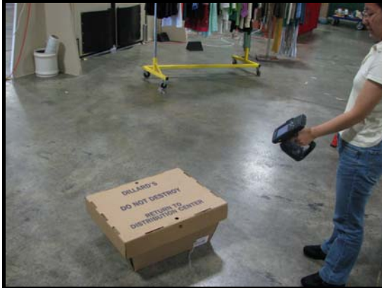
Photograph 4: Static Fixture—Mobile Reader Testing with Boxes

For the box test, items were tagged and placed in the transport box. An associate would use a mobile device to scan the items in the box by walking around the box while pointing the device at the box and move his or her arm in a sweeping motion within the vicinity of the items to capture the available reads. See Photographs 4 and 5.