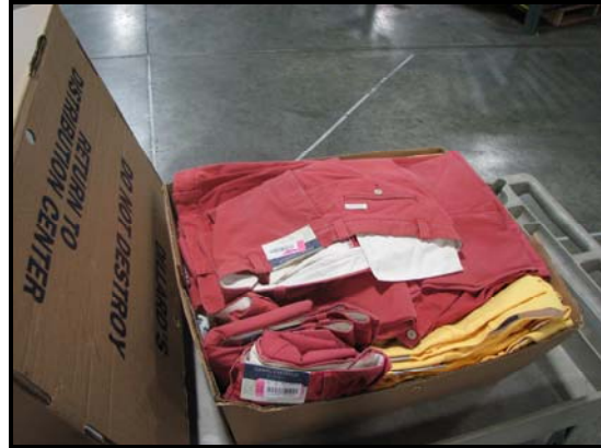
Photograph 5: Clothes Placement in Box