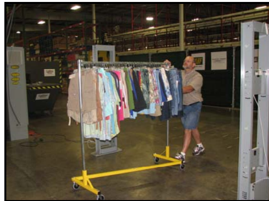
Photograph 14: Clothes Placement on Z-Bar