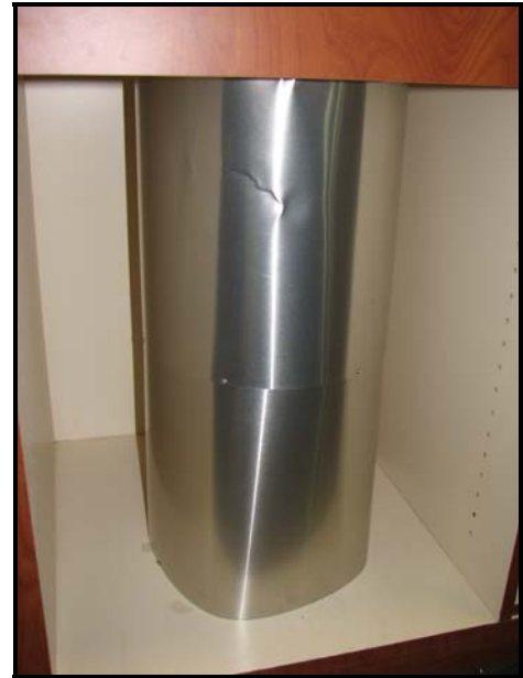
Photograph 9: Point of Sale Cylinder

For the POS test, the portal was a sales desktop with a reader and antenna. This test was performed using a static reader and one antenna. A cylinder made of aluminum was constructed and placed around the antenna (see Photograph 9). This was done to funnel the radio frequency field into a more precise read zone required for a practical POS application.